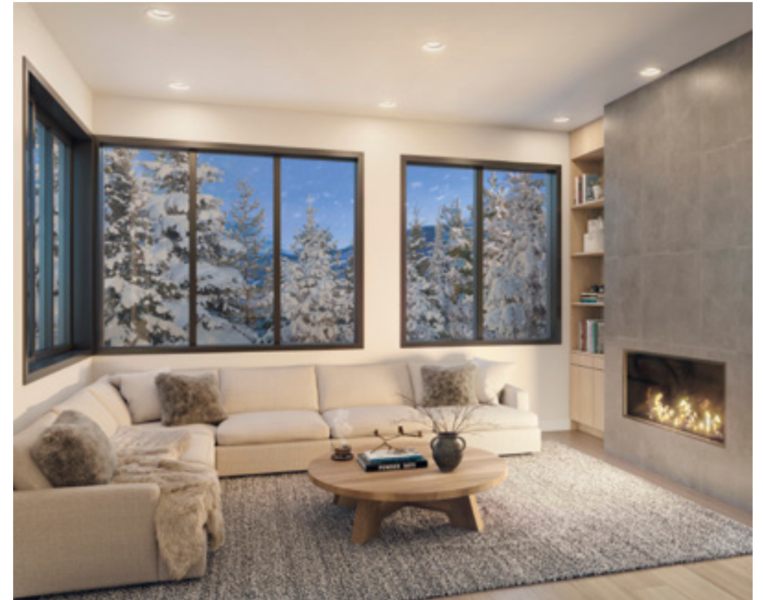
Top and above Texas White Ash RKP8105