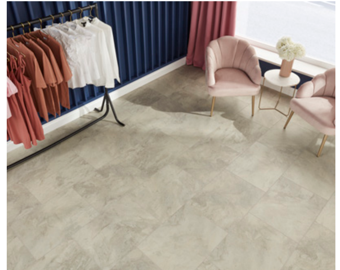
Right: Arctic Mist RKT3005-G

** Slip resistance is measured on ex-factory product. Slip resistance can be affected by surface contamination, use and how the product is maintained.