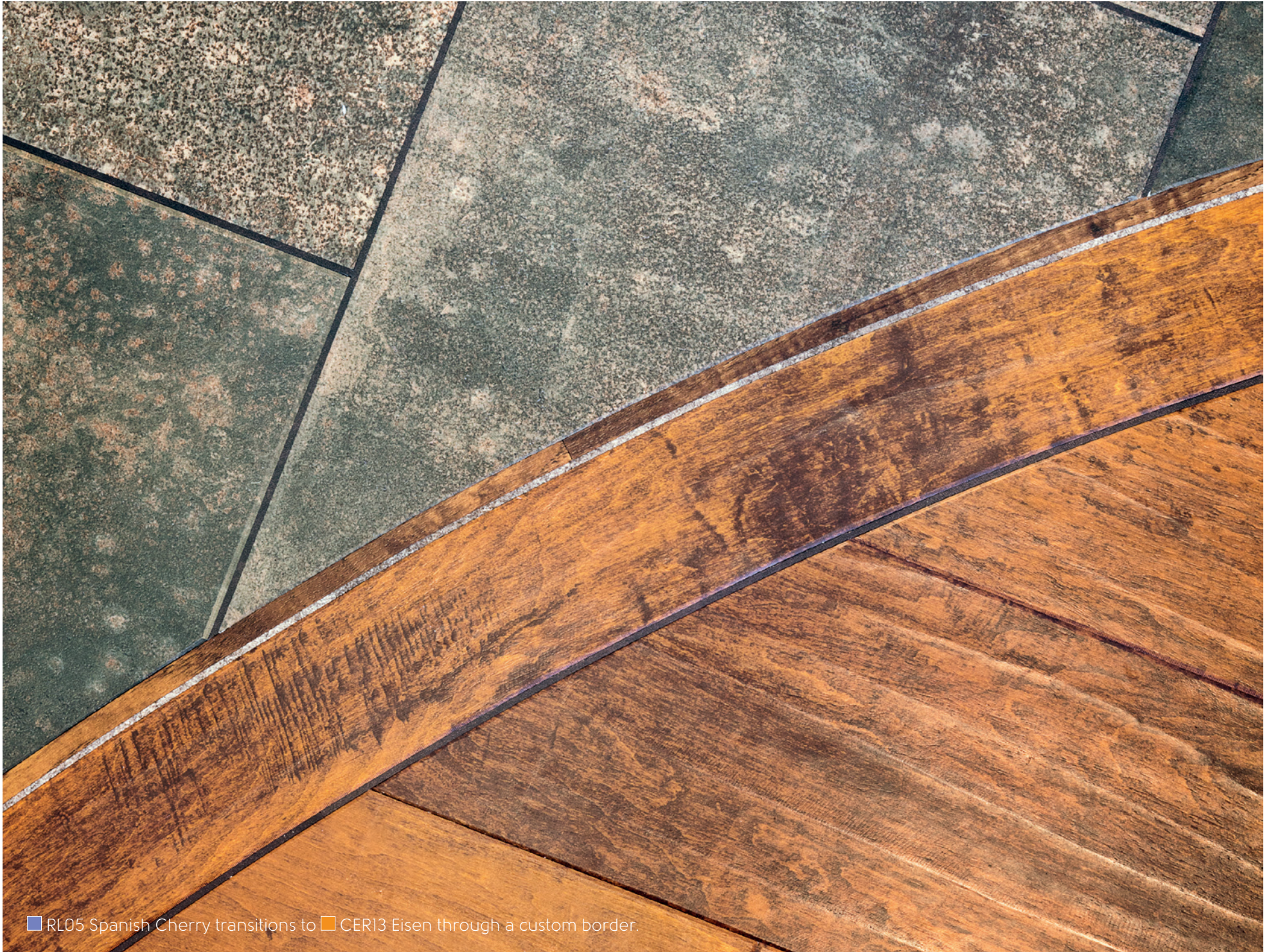
■ RL05 Spanish Cherry transitions to ■ CER13 Eisen through a custom border.