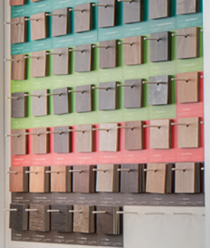
Kaleidoscope incorporates a mix of colors and geometric shapes ■ Hexa.